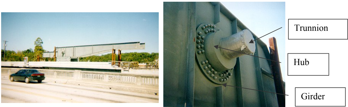
Figure 1 Trunnion-Hub-Girder (THG) assembly.

To make the fulcrum (Figure 1) of a bascule bridge, a long hollow steel shaft called the trunnion is shrink fit into a steel hub.