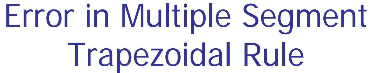
Table 1 shows the results obtained for the integral using multiple segment Trapezoidal rule for